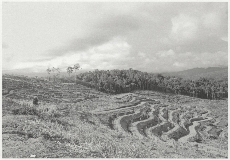
Fig. 2: Oil-palm fields on the Tzen plantation

pacifying and bringing new land into development and of supplementing the work of the colonial administration (Dennis [1981]:219).