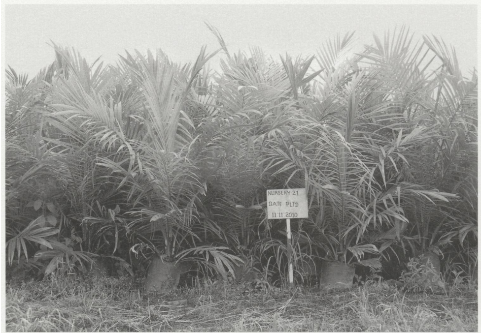
Fig. 3: Legible environments: the oil-palm nursery at the Tzen plantation

village not only as a site of earning and using money, i.e. one dominated by commodity relations, but also as a site of controlled, or alienated, labour. The Mengen workers noted that, whereas in the village people worked as they pleased, on the plantation they had to follow the commands and schedules of others.